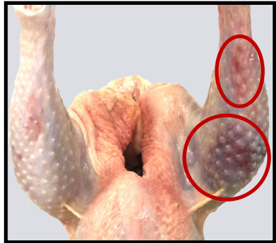
Fail (drumstick with various bruises that are > quarter size)