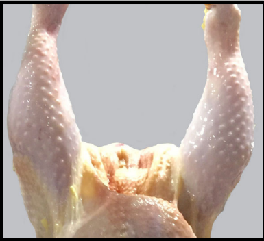
Pass (drumstick with normal skin color & no bruising)