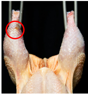
Pass (drumstick has a bruise but size is < quarter diameter)