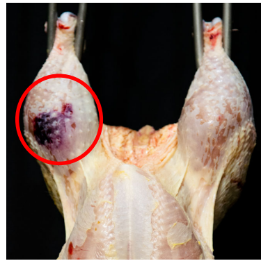
Fail (drumstick with one bruise > quarter diameter)