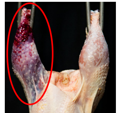
Fail (large and dark bruises on leg and possible broken leg)